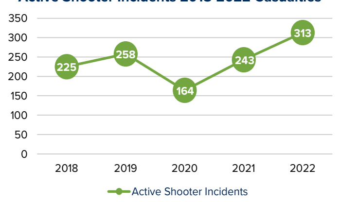
Exhibit 1 – Source: Federal Bureau of Investigation, 2022

Immediate deployment of law enforcement is essential to interrupting the shooter and mitigating harm to victims. Developing and practicing an active shooter emergency plan can further lessen the probability of harm until law enforcement arrives. Average police response time to an active shooter event is approximately fifteen minutes (according to the National Sheriffs' Association). Police response time includes: